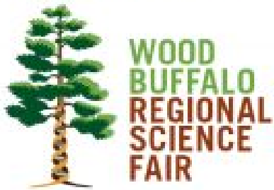
Exhibit Number: _____